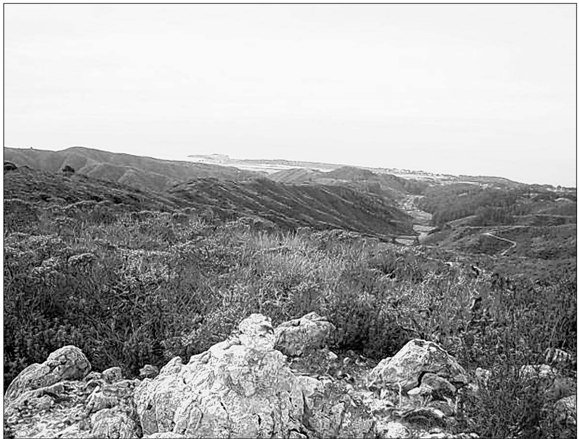
RANCHO CORRAL DE TIERRA

TechShop works with Disney/Pixar, Make Magazine, and The Exploratorium to create a nationwide program called “Young Makers,” designed to support kids who like to build things. The pilot program launches on Saturday, January 30 at The Exploratorium in San Francisco. There are two components to the program: Open Make, a series of public talks with Featured